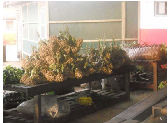
Bunches of fresh peanuts for sale at the Luganville market.

Bp Terry and I travelled from Santo to Port Vila on the afternoon of 11 April on a small twin otter aeroplane. It was a clear day and the view of the northern islands of Vanuatu from the small plane were spectacular. On arrival in Port Vila the airport attendants noticed that the back luggage door had been open the entire trip! Luckily, no luggage had fallen out and, most importantly, all of our equipment was in tact. The following morning Bp Terry and I caught a plane from Port Vila to Honiara.