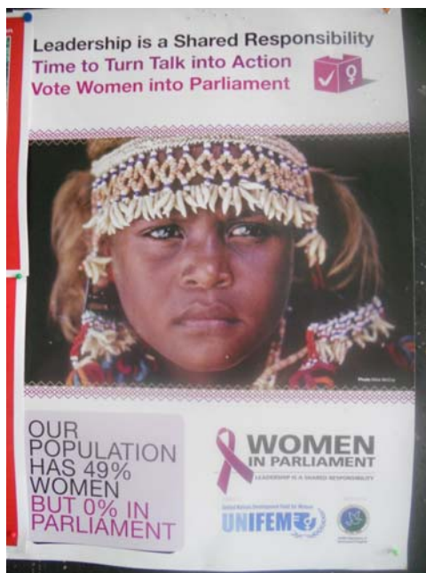
Poster encouraging women in parliament, YWCA offices, Honiara.