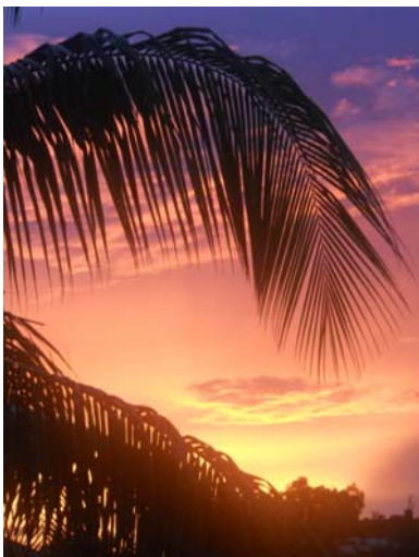
Sunset in Honiara, Apr 2011