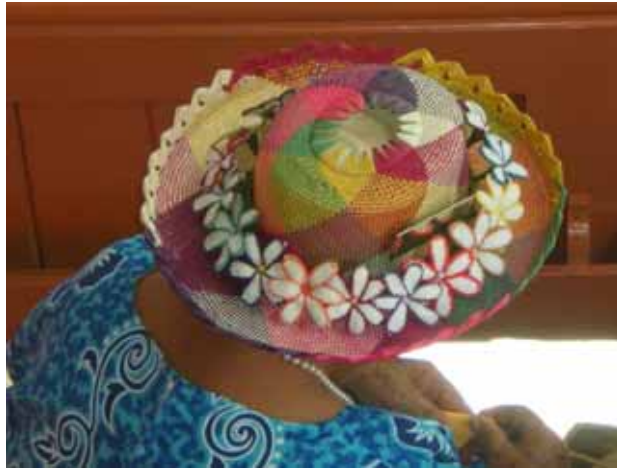
Detail of a traditional handmade hat women wear to church, Cook Islands Christian Church, Sunday 15 August 2010

PMB Fieldwork in Rarotonga, Cook Islands 6 – 29 August 2010