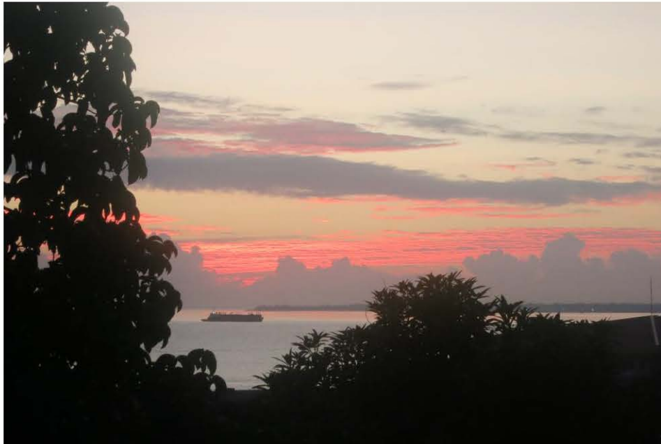
On my final morning in Honiara, the rain clouds cleared to reveal this beautiful sunrise