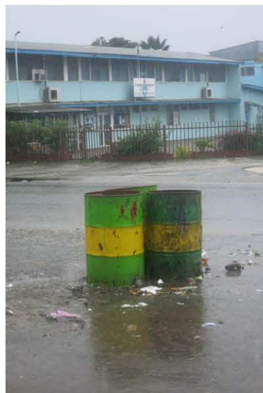
The rain was unrelenting during my two week stay in Honiara in June.

During my stay, Tropical Cyclone Raquel came across the north-west area of the Solomon Islands. For all but one of the days I was in Honiara it rained and rained and rained! Big fat drops and non-stop downpours made moving around difficult. For most of my fieldwork I left the digitisation equipment in a secure room at the National Archives of the Solomon Islands. On returning to Canberra, my laptop has had some serious problems that may have been caused by the wet and humid environment. Luckily it was still under warranty and has been re-built and is now working well again.