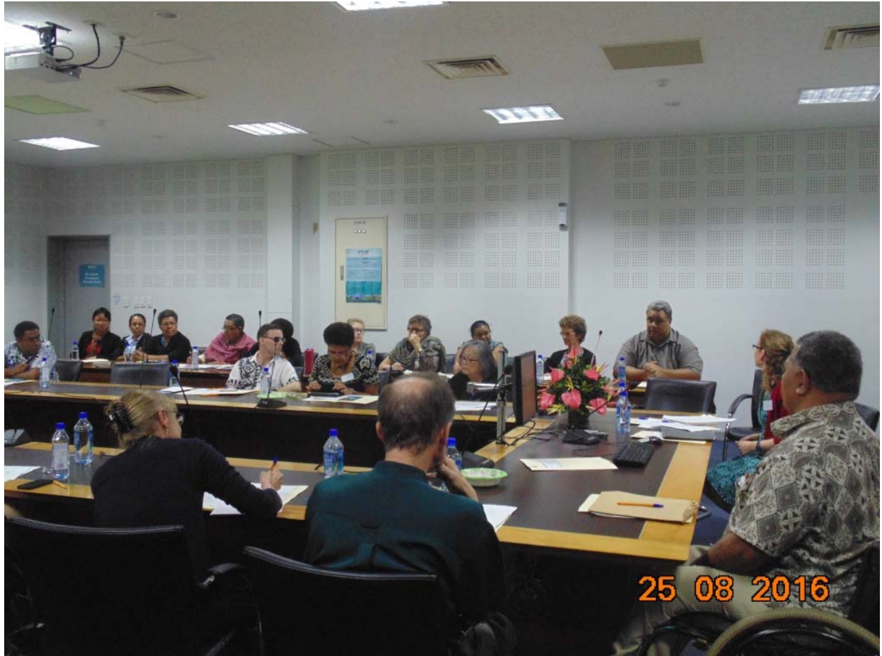
Participants at the Archives and Pacific Studies workshop held at the University of South Pacific