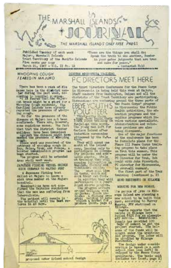
(right) Front page of The Marshall Islands Journal , March 21, 1967. Vol. II, No. 12