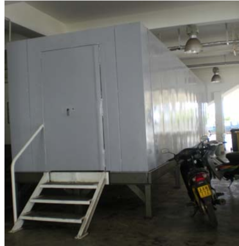
Storage container holding land records at the main office of the Ministry of Justice in Rarotonga.