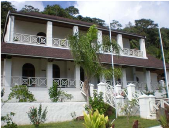
Takamoā Mission House of the Cook Islands Christian Church, Rarotonga. The house was built by members of the London Missionary Society in the 1830s and extensively renovated in 2009.