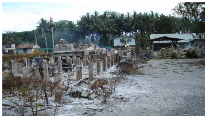
Lowlands Agricultural Research Station (NARI) Keravat, burnt down, 11 April 2011.