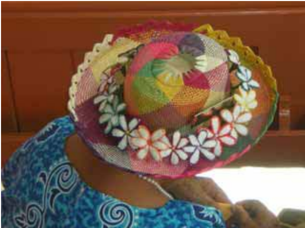
A traditional handmade hat women wear to church, Cook Islands Christian Church, Avarua, Sun. 15 August 2010.